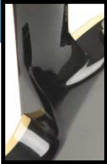
■ JJ's own humbuckers are routed through the company's intriguing Love Tone circuit

It must be a more labour-intensive approach, but the result feels great and is as effective as most.