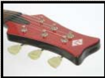
■ The Electra V features Gotoh locking tuners

A COUPLE OF CLASSY HUMBucker-LOADED GUITARS THAT OFFER GREAT BUILD, GOOD LOOKS AND PLENTY OF VERSATILITY