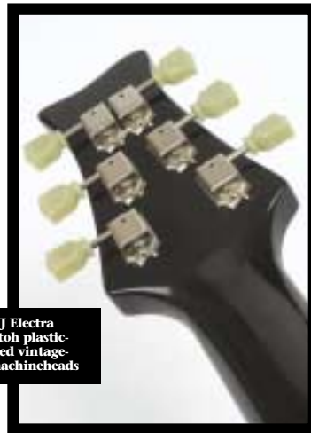
■ The JJ Electra has Gotoh plastic-buttoned vintage-style machineheads

It's been mentioned in past reviews that in the early days of JJ Guitars, the guys managed to purchase a batch of rosewood fingerboard blanks that were originally destined for Burns guitars during the 1960s. The good news is that supplies of this well-seasoned timber are still