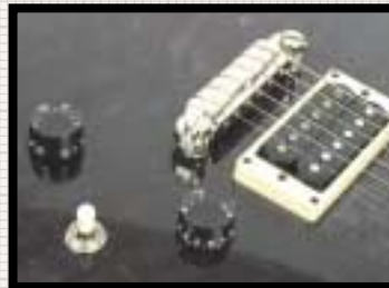
■ The tone knob has a handy push/pull coil split