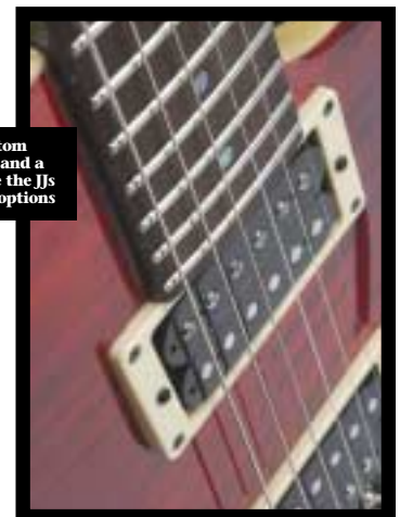
■ Two JJ Custom humbuckers and a coil split give the JJs lots of tonal options

Clean sounds are just as rewarding if you lean toward the warmer kind of single-coil tones, especially