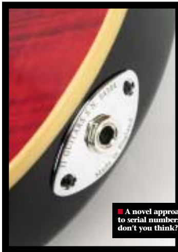
■ A novel approach to serial numbers, don't you think?