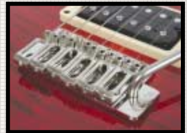
■ The Electra V has a superbly efficient vibrato