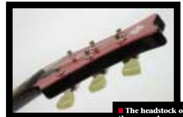
■ The headstock on these samples comes with a smart body-matching veneer

slippery Hendrix and Frusciante-type licks and partial chords. There's plenty of scope for tight jazzy excursions on both neck pickups, too – surprisingly appealing stuff.